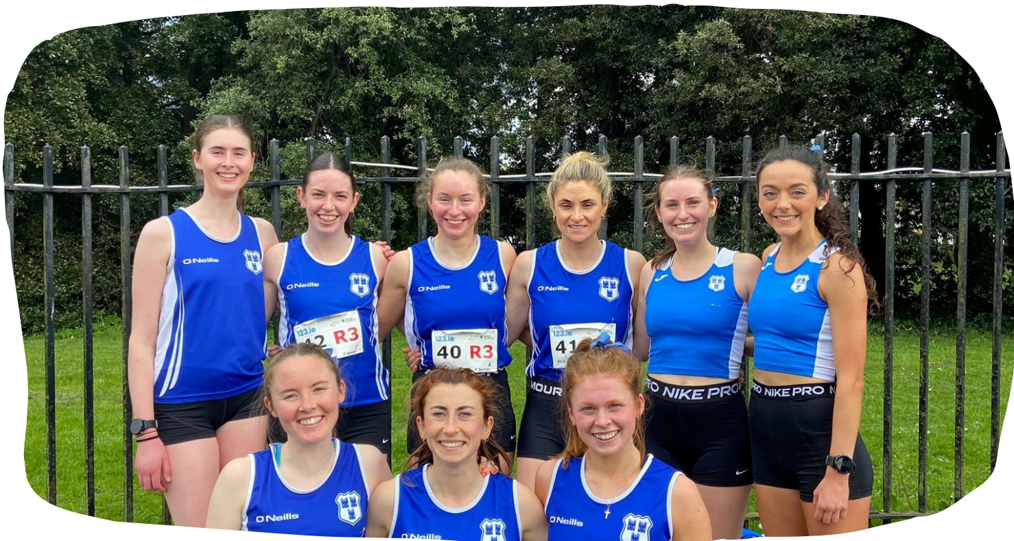
The 3 DCH women's teams at the National Road Relays in Raheny

April 28th We had three women's and two men's teams competing in the National Road Relay championships in Raheny. This was the first time in many years that we had a men's team competing.